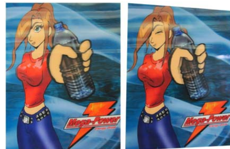
Multiple Effects - MegaPower Side by Side

Not only can we provide images that move, flip, or are 3 dimensional, but we can also provide you imagery that combines these effects for a greater impact.