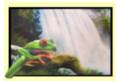
3D Lenticular Frog

Now through May 31, 2010, you can get FREE press set-up for your lenticular order. This is a $195 savings.